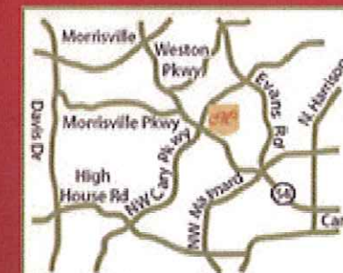
Location! Location! Location!

Construction Completion for 2009 Move In Call Today to Take Advantage of Our Introductory Specials!